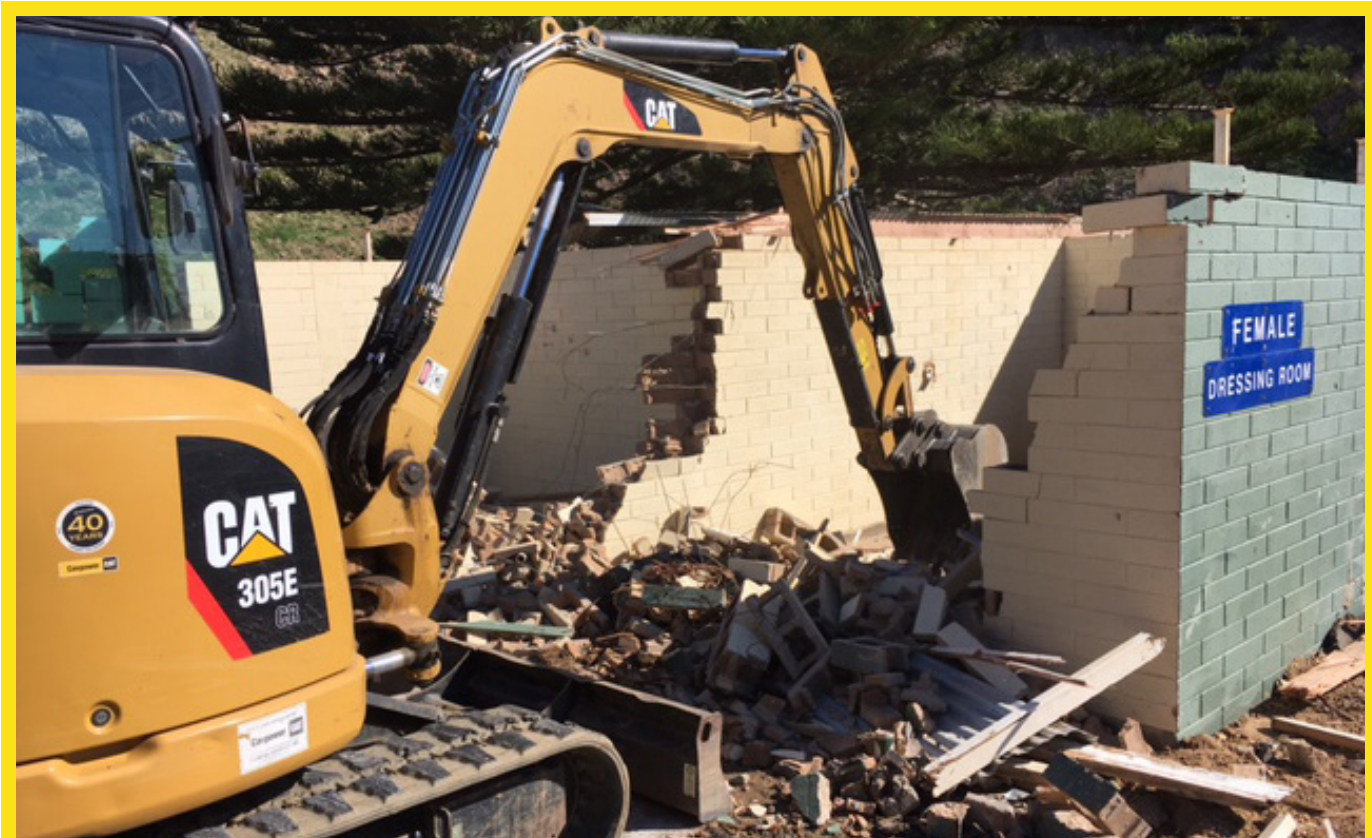
Image: Second Valley Toilet Block Demolition

Council is busy at work with a number of significant infrastructure projects which will enhance the district.