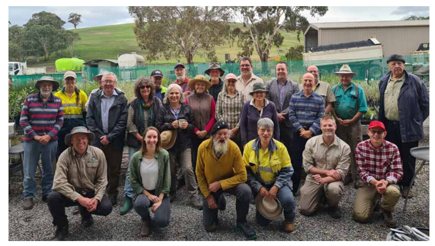
Thank you to all the volunteers past and present that help make the Community Nursery a success.