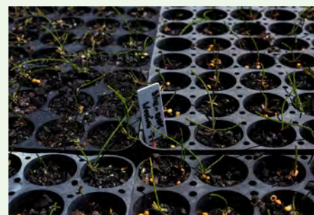
Sheoak seedlings that have been propagated.

If you are interested in volunteering at the Nursery, please contact nursery@flec.com.au to find out more. It is a great opportunity for locals to learn about the environment and gain knowledge about local flora.