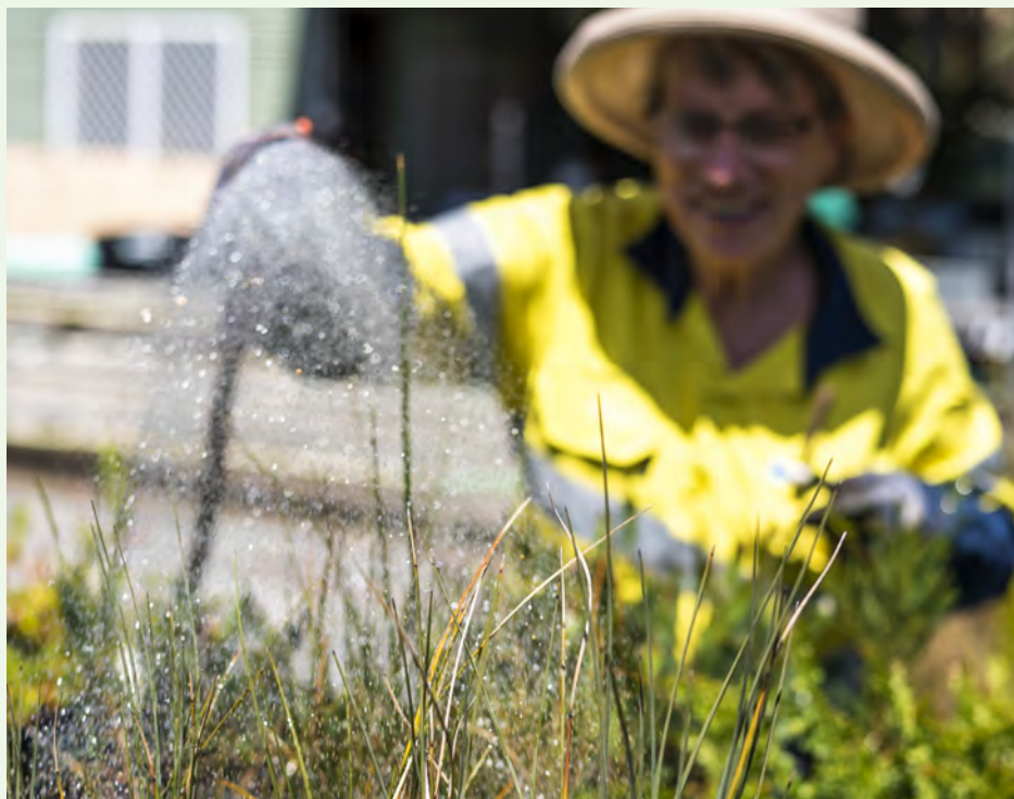
Community nursery volunteer tending to the plants that have been grown.

The Nursery has expanded its operations significantly since it's birth, with plants now being grown for projects across the Fleurieu and the nursery infrastructure ever improving thanks to grant funding from the Foundation for National Parks and Wildlife and the continued support and funding from Green Adelaide and the District Council of Yankalilla.