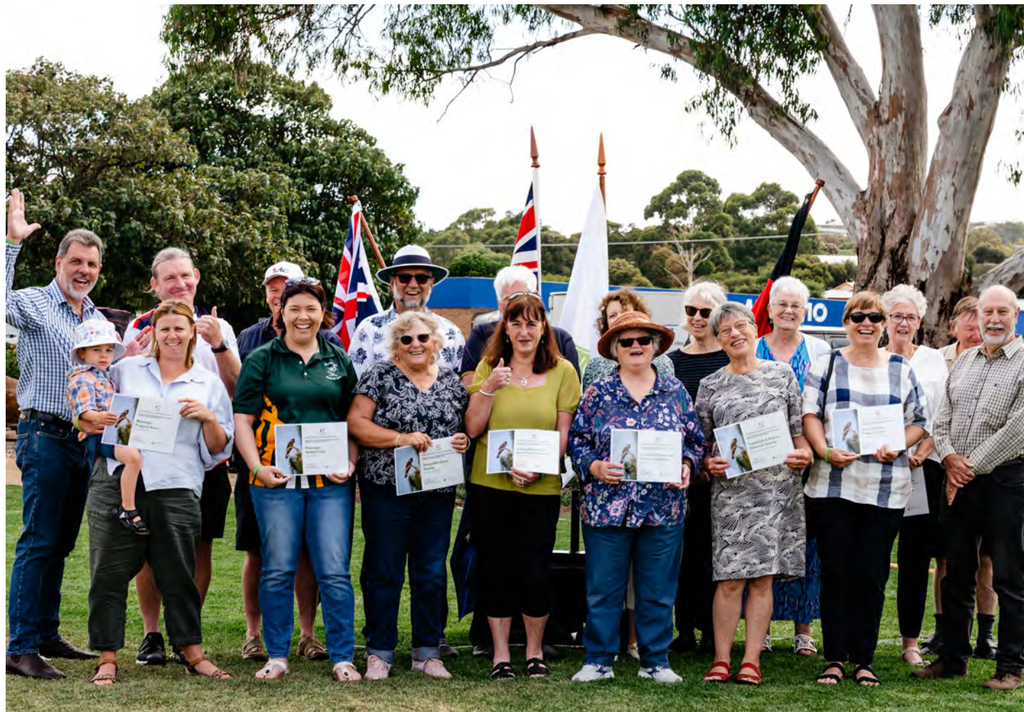
Community Grant recipients 2023.

https://www.yankalilla.sa.gov.au/library-and-community/council-grants/community-grants