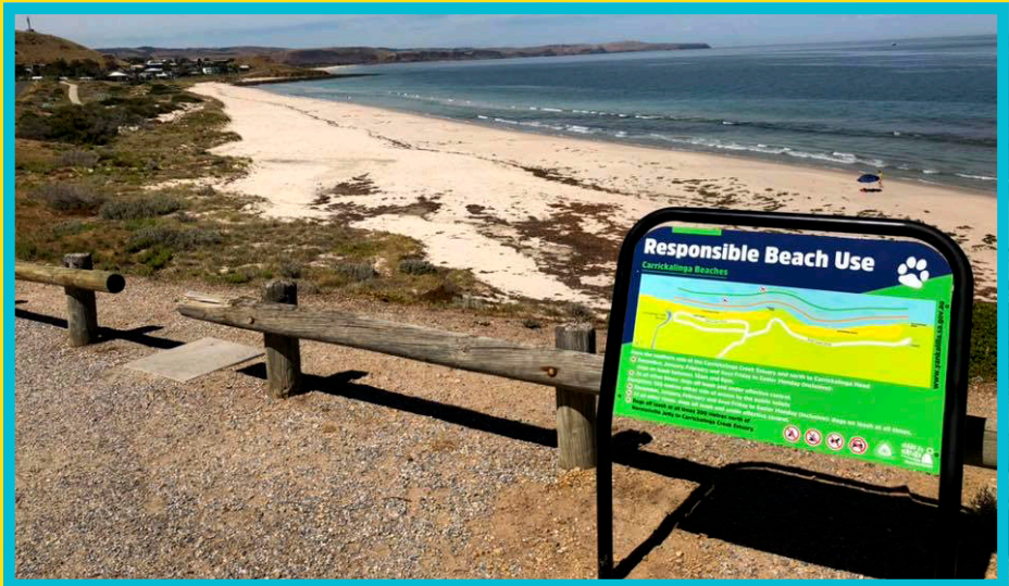
The new Responsible Beach Use signage at Carrickalinga

New signage and drinking fountains have been installed in townships and along the coast to assist the public in way finding, highlighting attractions and their responsible beach use, as well as allowing both people and their dogs to grab a drink.