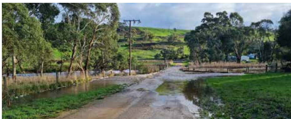
Myponga Flooding at Rogers Road