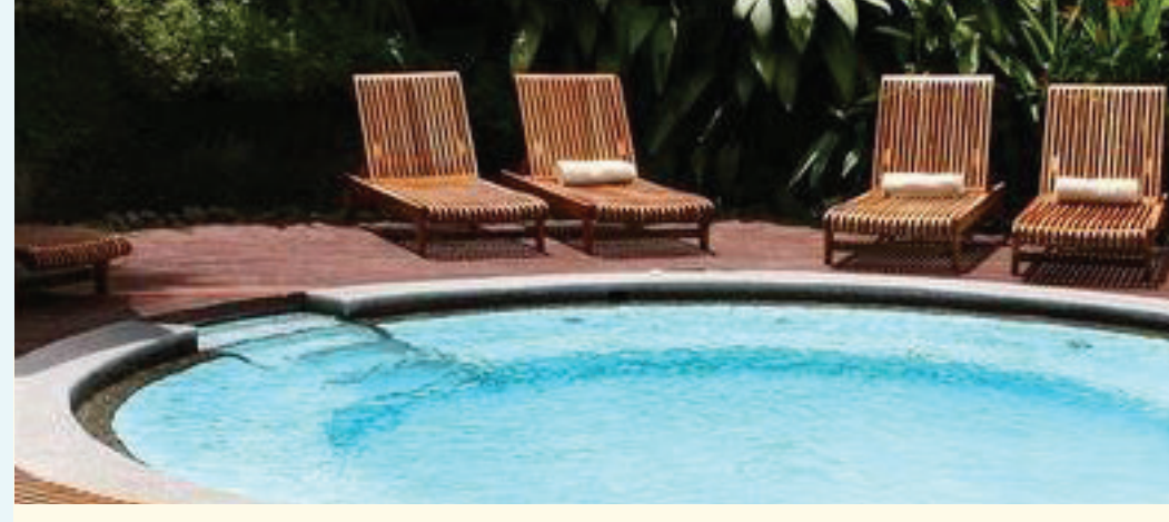
Image Above: Pool and spa maintenance is still important over the cooler months!

I'll be devoting much of my time in May to consulting with residents about the 2019/2020 budget. I look forward to chatting to as many locals as I can and encourage residents to visit our website – and check their letterboxes - for details about our upcoming public meetings.