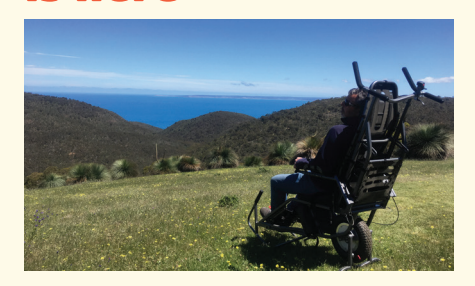
Image Above: The all-terrain TrailRider wheelchair at Goondooloo Ridge, Deep Creek.

Thanks to a special partnership between Council and Conservation SA, we now have a free all-terrain TrailRider wheelchair available for people keen to explore our wonderful Fleurieu Coast.