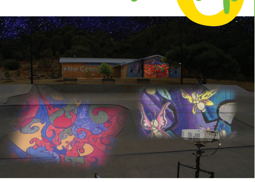
Image Above: A taste of Lions Youth Park Skate Bowl illuminated with artwork.