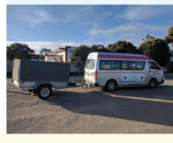
Image Below: The Community bus ready for pick-ups and drop-offs at Cape Jervis.

which enables it to be taken on walking tacks and even up and down stairs – places the traditional wheelchair just cannot go.