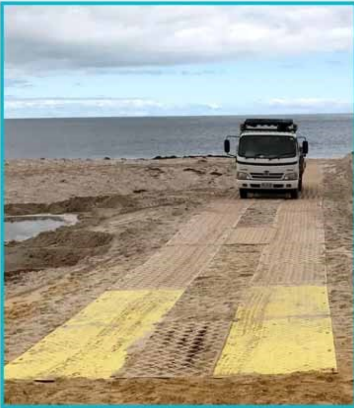
Beach access mats are installed at Normanville Beach ready for the summer season

Access to Normanville Beach for boaties will be much easier over the summer season thanks to the re-installment of 'temporary' beach access mats.