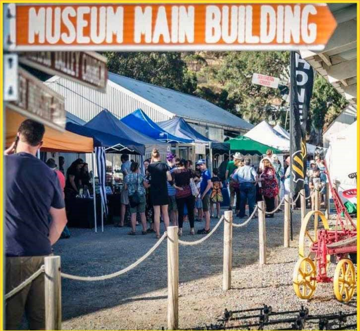
Twilight Market in the Museum held at the Fleurieu Coast Visitor Centre