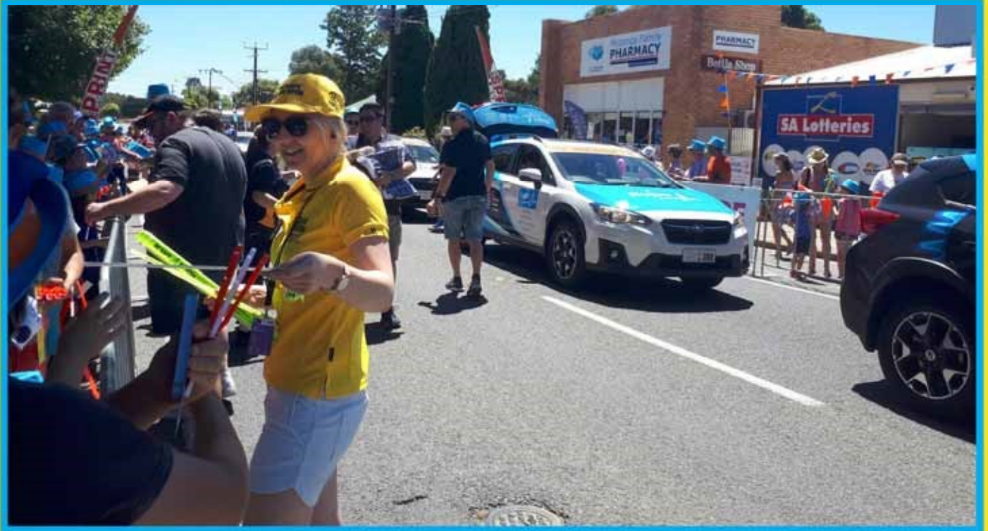
The crowd at Myponga enjoys the beginning of the Santos Tour Down Under

A reminder that traffic management conditions and rolling road closures throughout the day will be conducted by event staff and SA Police.