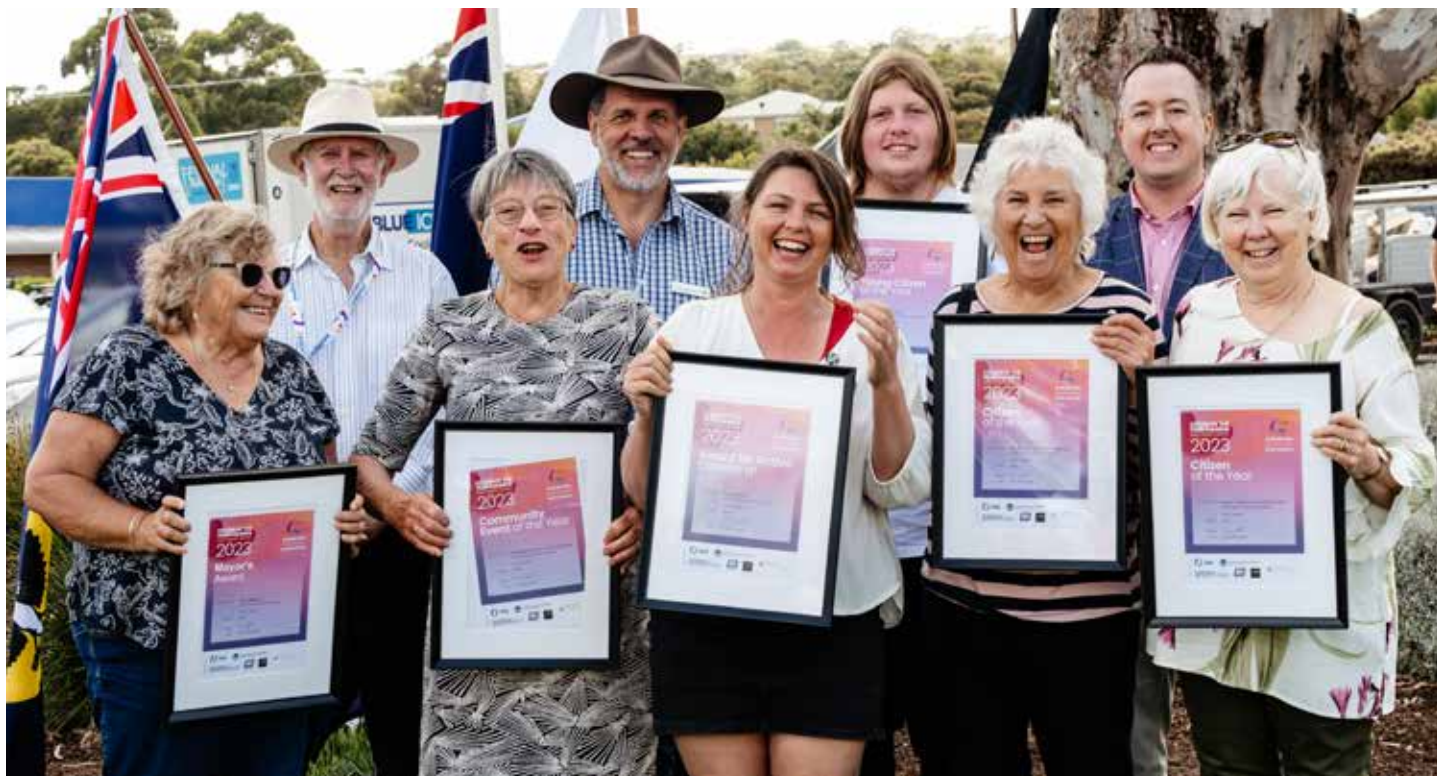
2023 Citizen of the Year Award Winners

Each year, South Australia celebrates the achievements and contributions of outstanding members of their communities through the Citizen of the Year Awards. These individuals offer remarkable service each day and so often this is invisible to us. They don't do it for the praise or for recognition – they do it simply because it makes a difference to the people of our state.