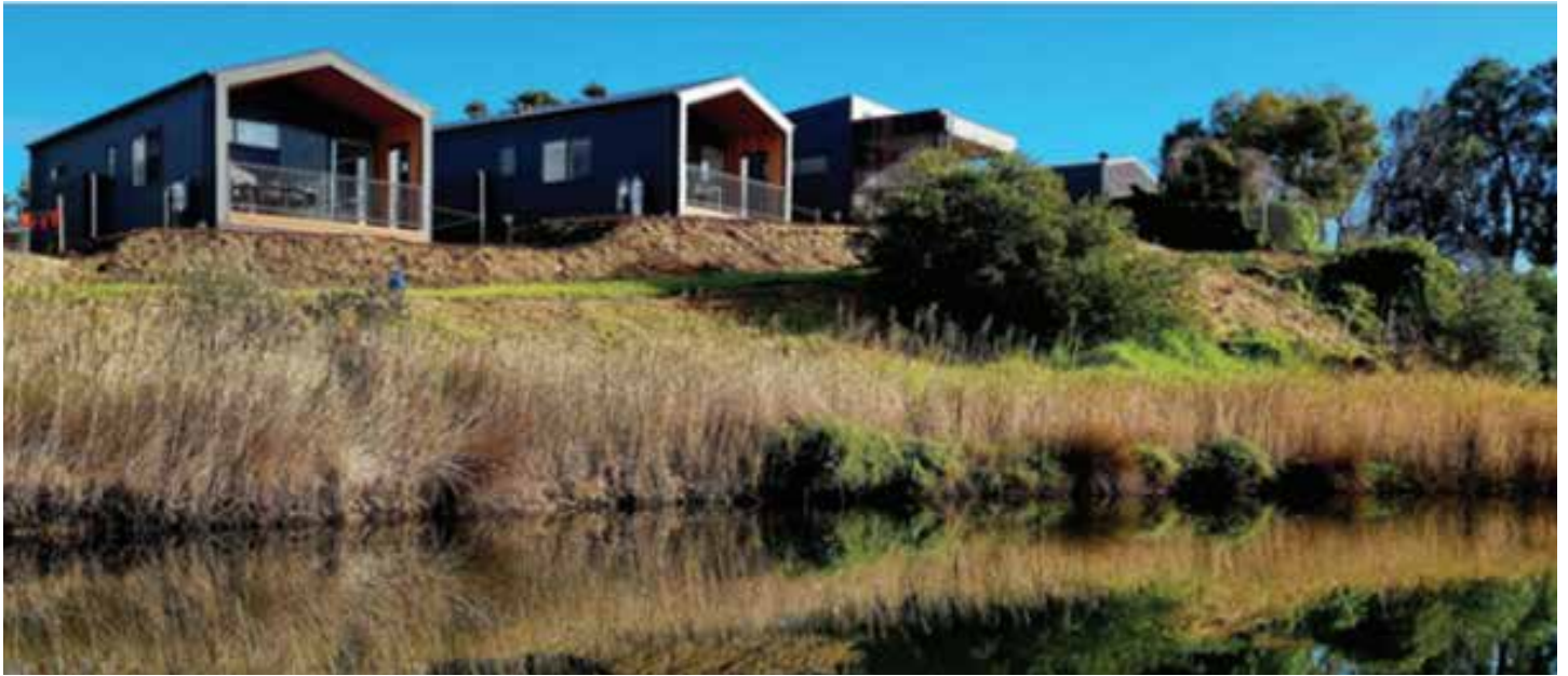
BIG4 Normanville Jetty Holiday Park