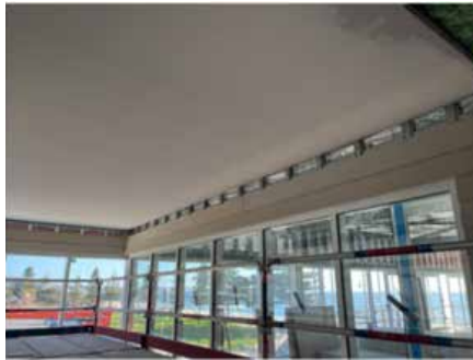
Interior works continue at the Normanville SLSC Cafe/Kiosk

The Normanville SLSC & Cafe/Kiosk project is progressing well on multiple fronts. The interior work is advancing with wall and ceiling linings and the installation of hard flooring in public restrooms. Meanwhile, external civil preparation is also underway, with concrete works expected to commence in the coming weeks. This progress confirms that the project is moving steadily towards its completion goals while maintaining a good level of efficiency.