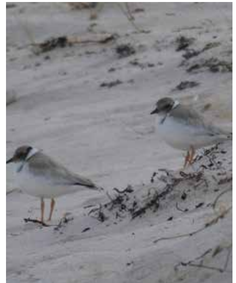
Two Hooded Plover Chicks that fledged at the Bungala River mouth at Normanville South.

The Hooded Plover project is jointly coordinated by Green Adelaide Landscapes Hills and Fleurieu and BirdLife Australia with support from local Councils. It is funded by Green Adelaide and Landscapes Hills and Fleurieu, through funding from the Australian Government's National Landcare Program.