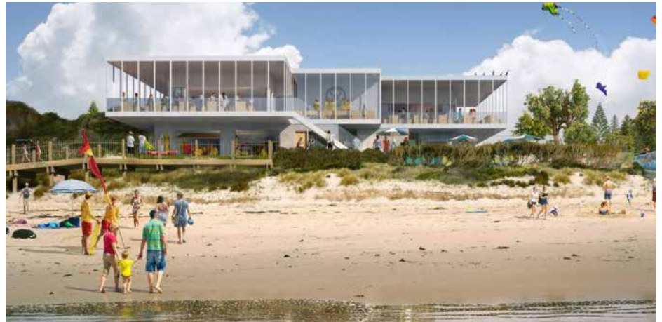
Artist impression of the new Normanville Surf Life Saving Club

the Normanville Surf Life Saving Club and Surf Life Saving SA. The level of collaboration includes the Commonwealth and State Government who have provided Grants to support elements of the overall Masterplan.