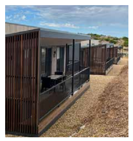
Big 4 Normanville Jetty Holiday Park:

Council administration is recommending a desirable governance structure to assess and recommend lease options for the leasable spaces within the SLSC & Café/Kiosk. It is proposed that the review panel will consist of Savills agents, Council's CEO and Director Assets and Environment, Mayor and Deputy Mayor and an independent community representative.