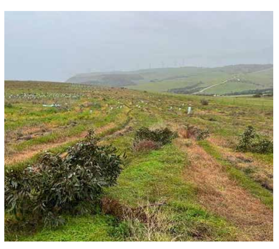
Over 44 hectares of direct seeding and community revegetation at Cape Jervis

Since the community planting events in July the Gloss Black Cockatoo had been seen at nearby Fishery Beach revegetation site and the Deep Creek Conservation Park.