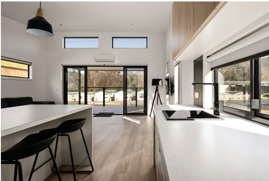
Image: Example of Cabin Internals - YMH project in Bright VIC

The Cabin Project is one element of the District Council of Yankalilla's overall Normanville Foreshore and Jetty Caravan Park Masterplan which also comprises of a combined new rebuild of the Surf Club and Kiosk, carparking, green space (lawns), nature play playground, dune restoration, beach interface and accessibility upgrades.